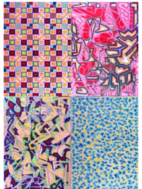
▶ Jaime Sanchez, 190930 , 2019, oil, ink and acrylic on paper, quadriptych.

Hang your photo frame where it can inspire you everyday!