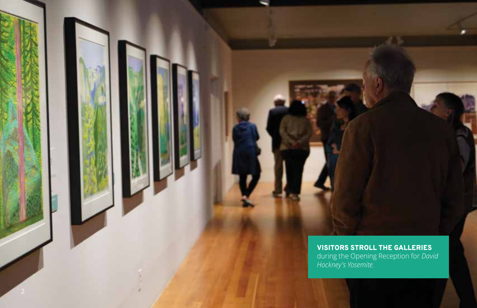
VISITORS STROLL THE GALLERIES during the Opening Reception for David Hockney's Yosemite .