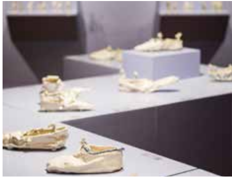
Installation view, Coille Hooven: Dancing for the Moon .