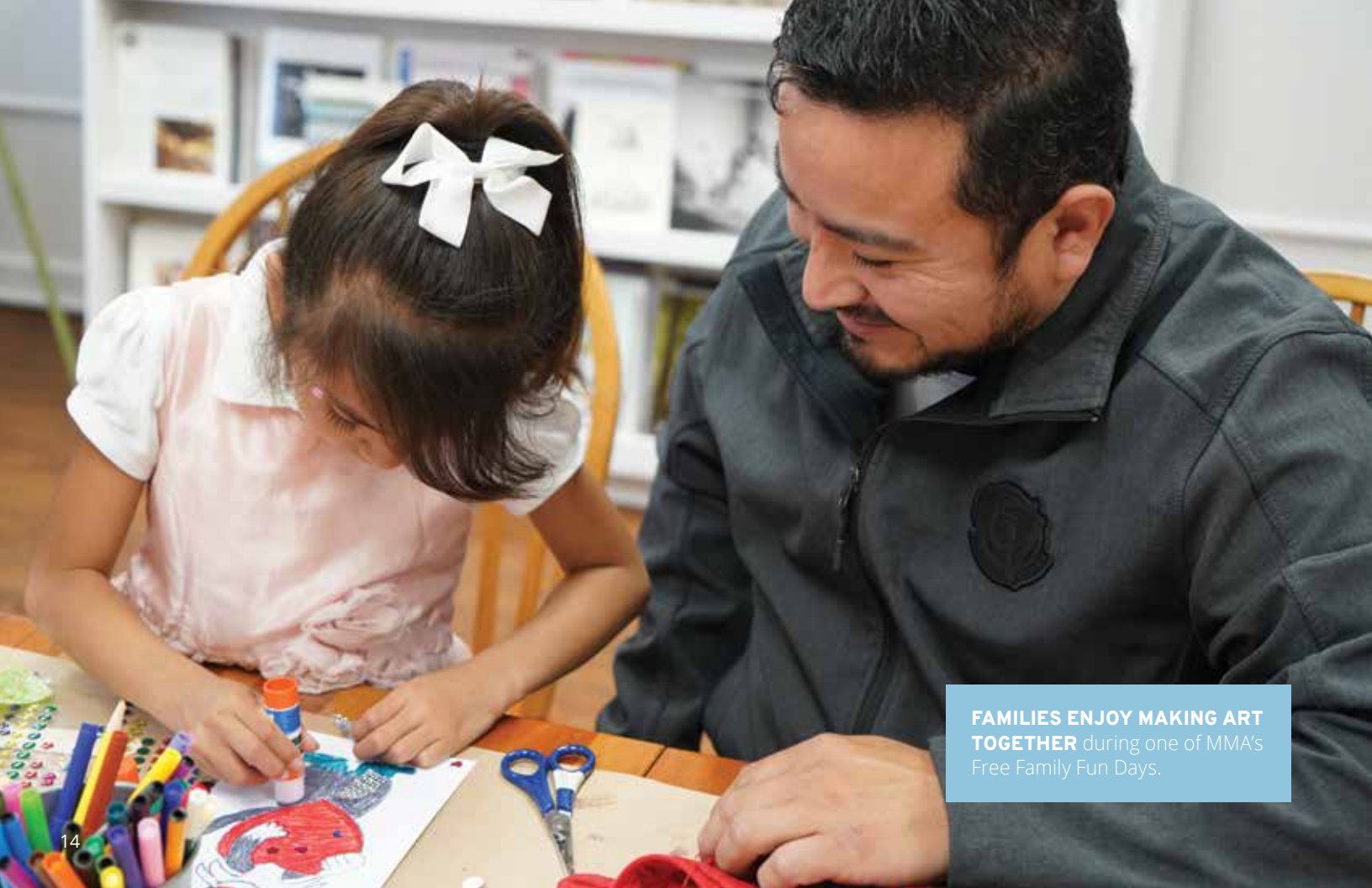
FAMILIES ENJOY MAKING ART TOGETHER during one of MMA's Free Family Fun Days.